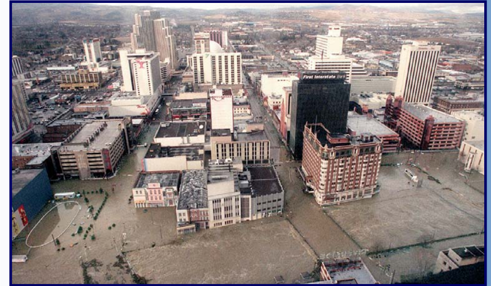
January 1997 flooding in downtown Reno, Nevada.

In Nevada, we have both flash floods and river floods even though most of us live in a desert environment. Whether you live near the foot of a mountain canyon, a dry wash, or on the floor of a broad river valley, you should make preparations ahead of time for damaging flood events. A team of local government officials and educators have worked with the Nevada Division of Water Resources to create an award-winning new website, http://www.NevadaFloods.org . Are you prepared?