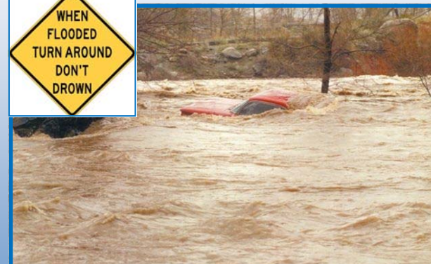
Car trapped in the Truckee River, Reno, Nevada during January 1997 flood.