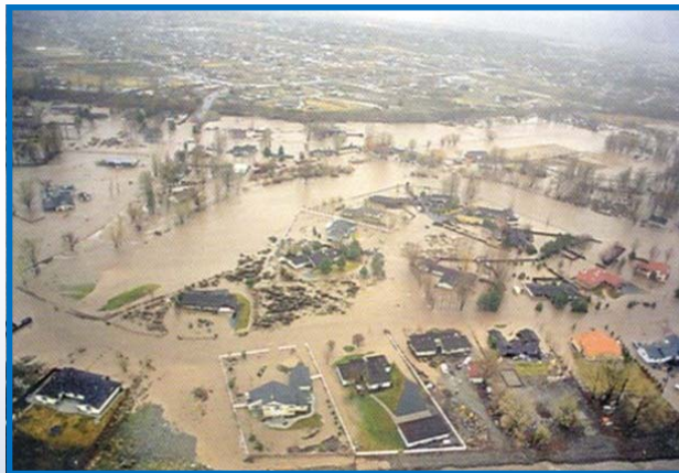
Flooding of homes in Gardnerville, Nevada, 1997.