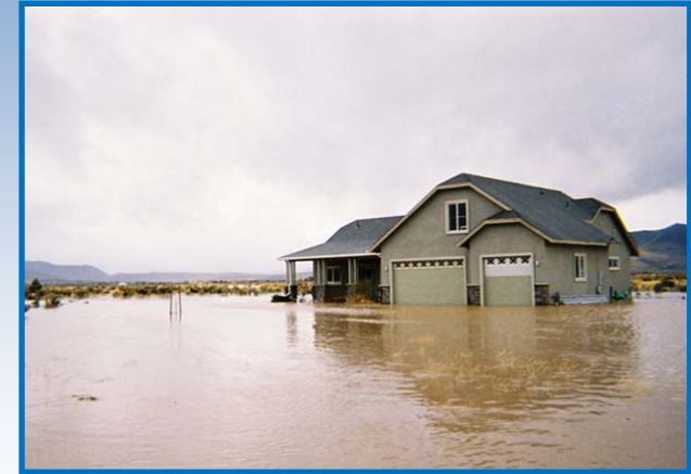
Flooded home in Lyon County, Nevada, 2005.