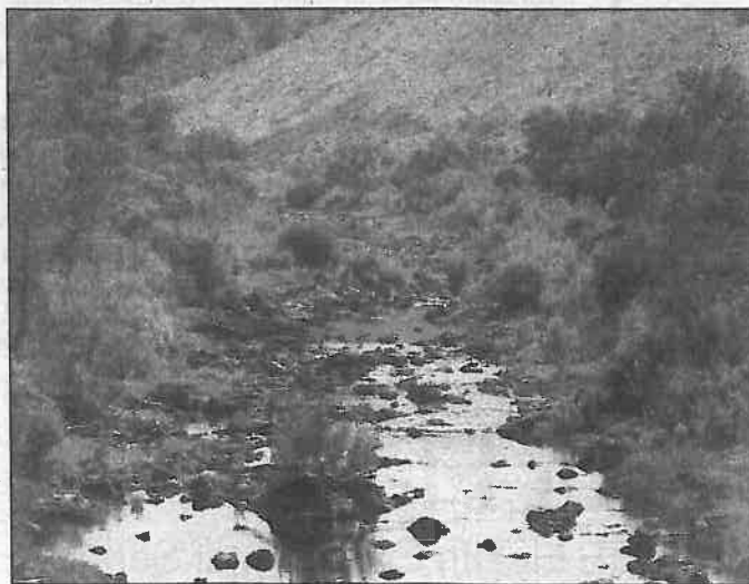
The Carson River shown here as it flows out of Brunswick Canyon Wednesday.

"We feel pretty good for this current year," said Schulz. He put next summer's city posture in a different light should the drought and continuing downward pressure on effluent wastewater supply make