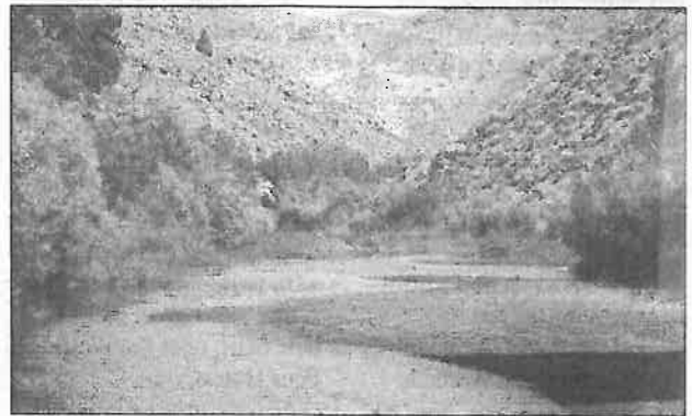
The Carson River flows under the Deer Run Rd. bridge on Wednesday.