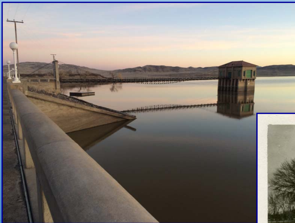
Churchill County, Nevada, 1907 & 2017