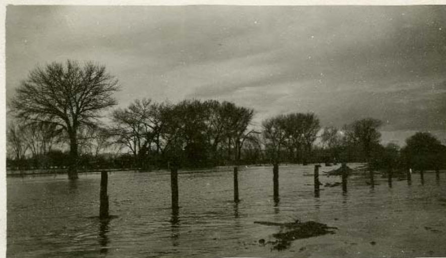
FALLON FLOOD 1907