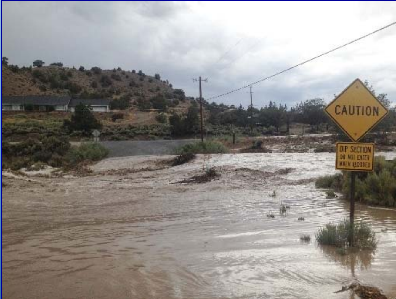
Douglas County, Nevada, 2014