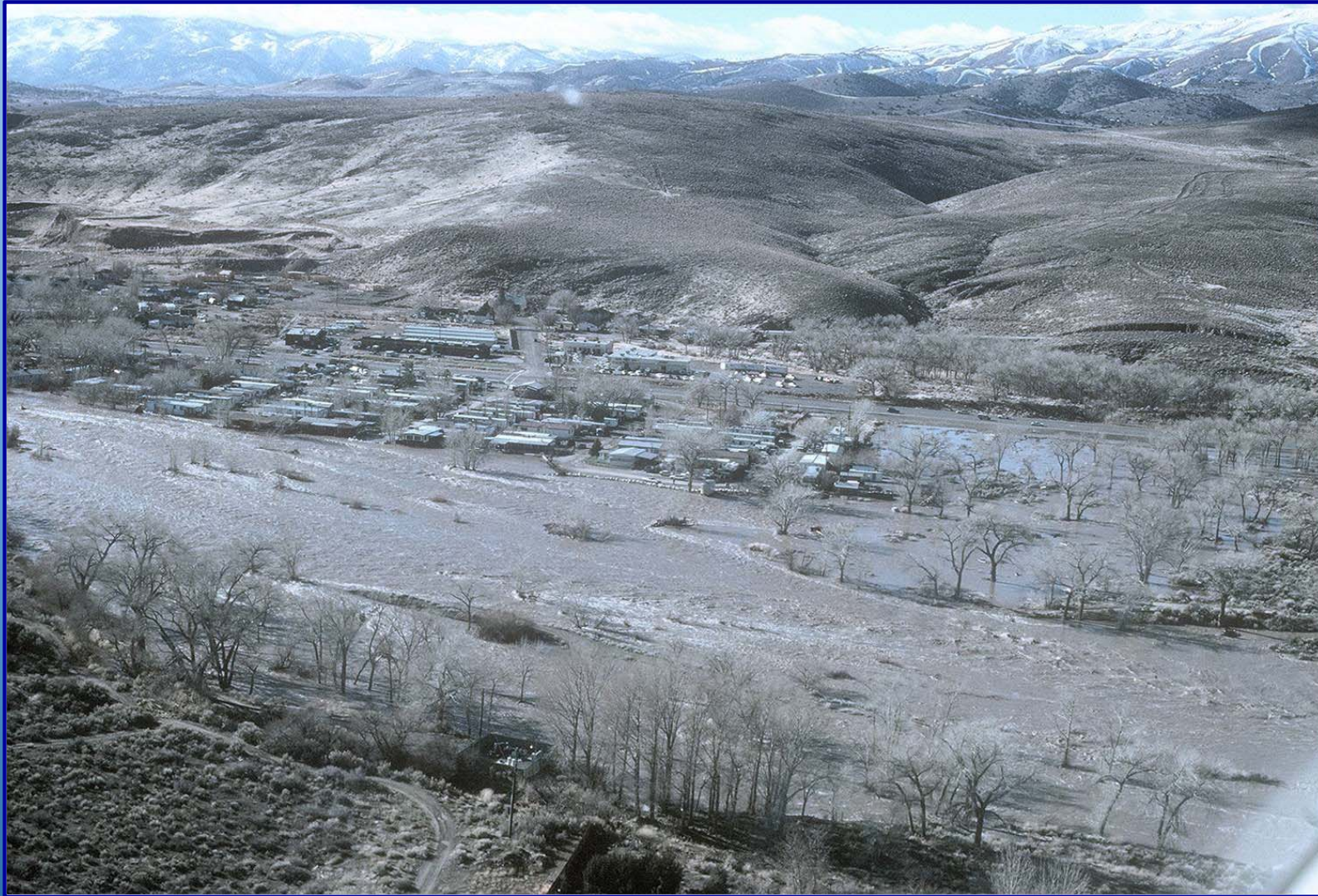
Dayton Valley in Lyon County, Nevada, 2006