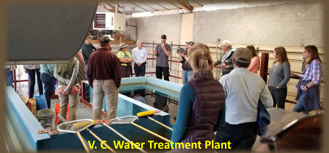
V. C. Water Treatment Plant