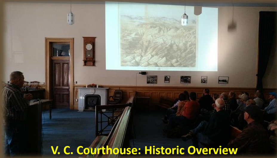
V. C. Courthouse: Historic Overview