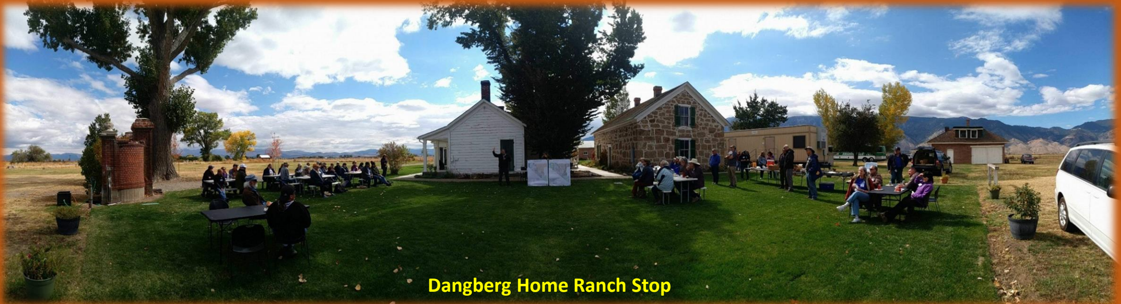
Dangberg Home Ranch Stop

What to add? "Carson Valley irrigation system"