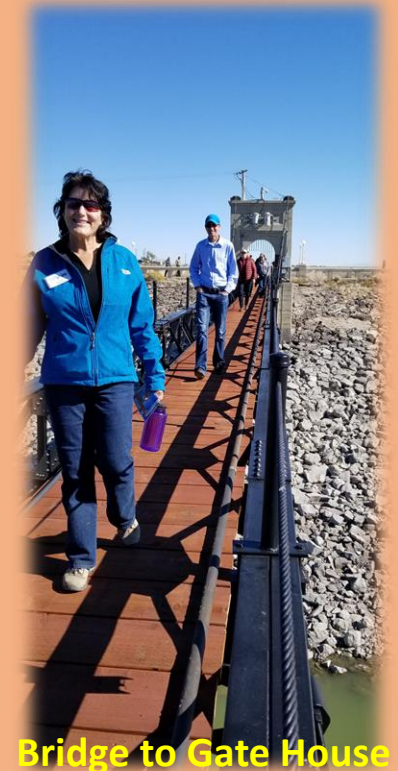
Bridge to Gate House