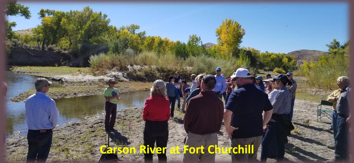
Carson River at Fort Churchill