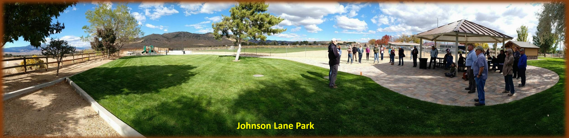
Johnson Lane Park

Name one new thing you learned? "Alluvial fan flooding issues"