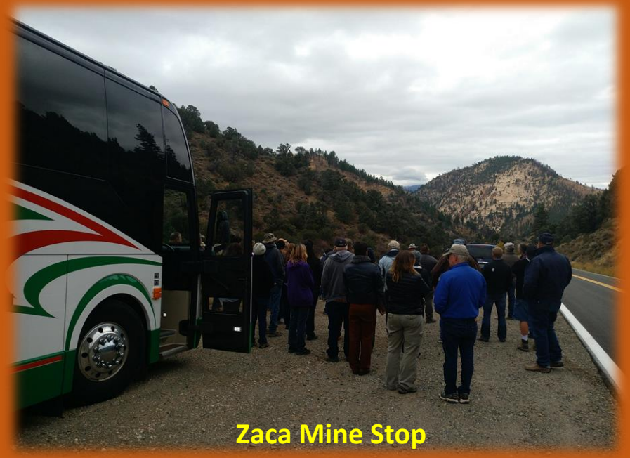
Zaca Mine Stop

My favorite part of the tour??? "Zaca Mine and Leviathan Mine Discussion"