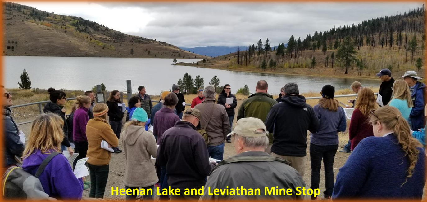
Heenan Lake and Leviathan Mine Stop