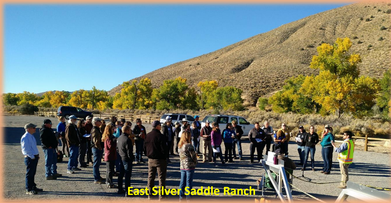
East Silver Saddle Ranch

Tour Improvements? "Would have liked to spend more time at Silver Saddle Ranch Area"