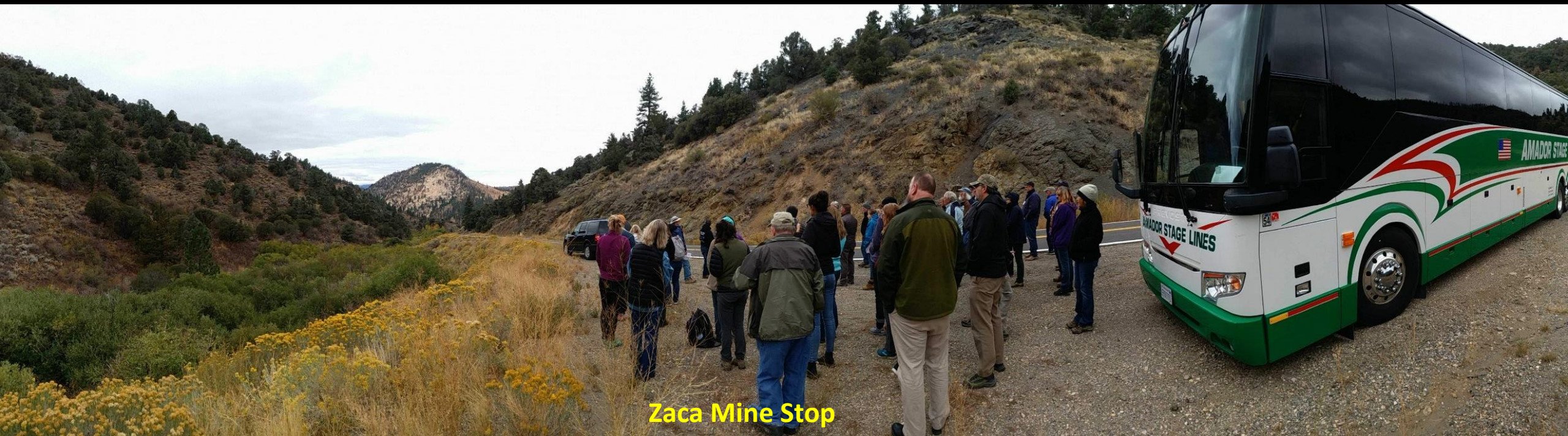
Zaca Mine Stop