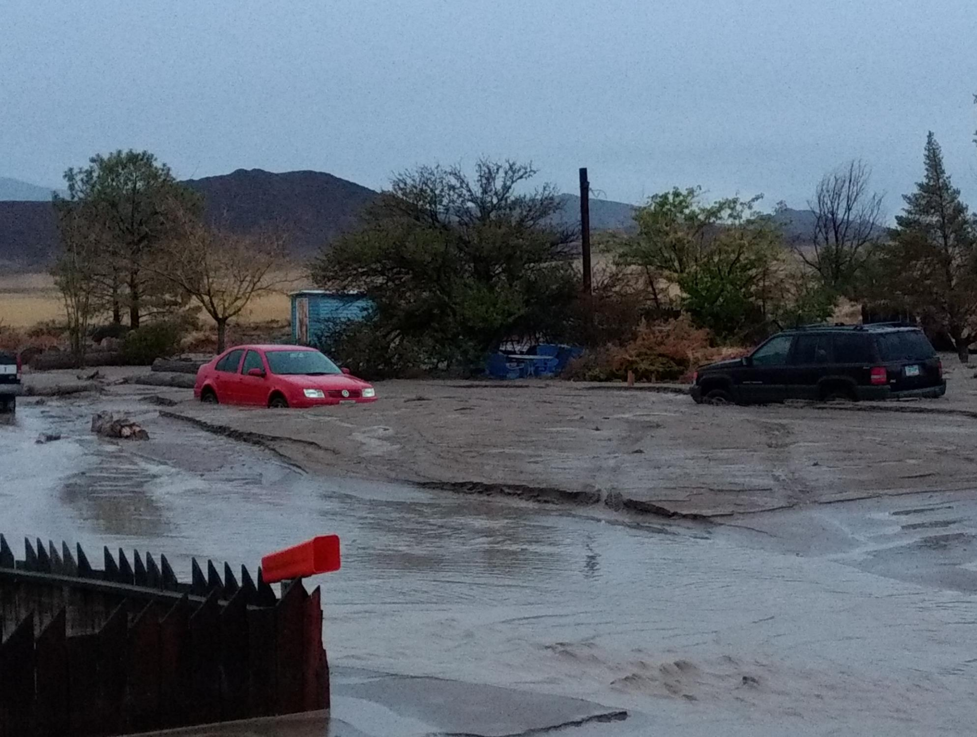
Lyon County 2018