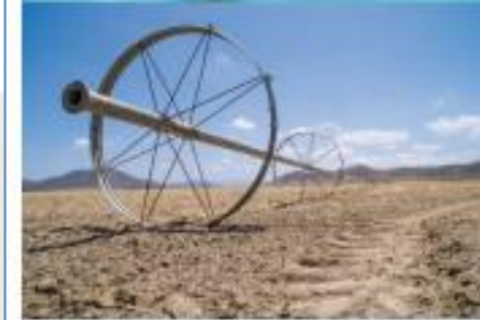
LONG-TERM WATER RESOURCE PLANNING