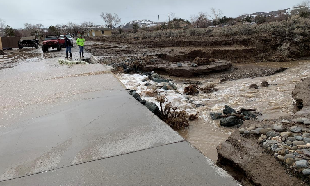
Smelter Creek in Ruhentstroth