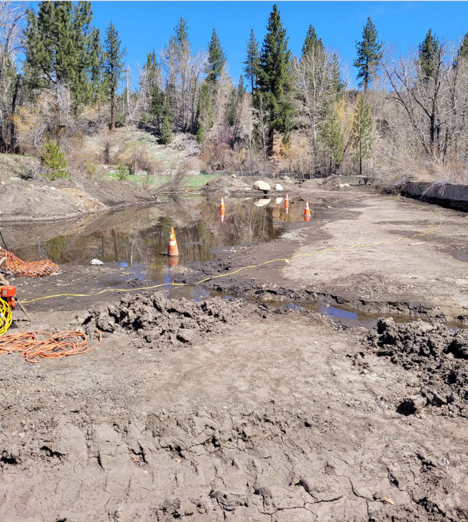
Heritage Park in April 2023