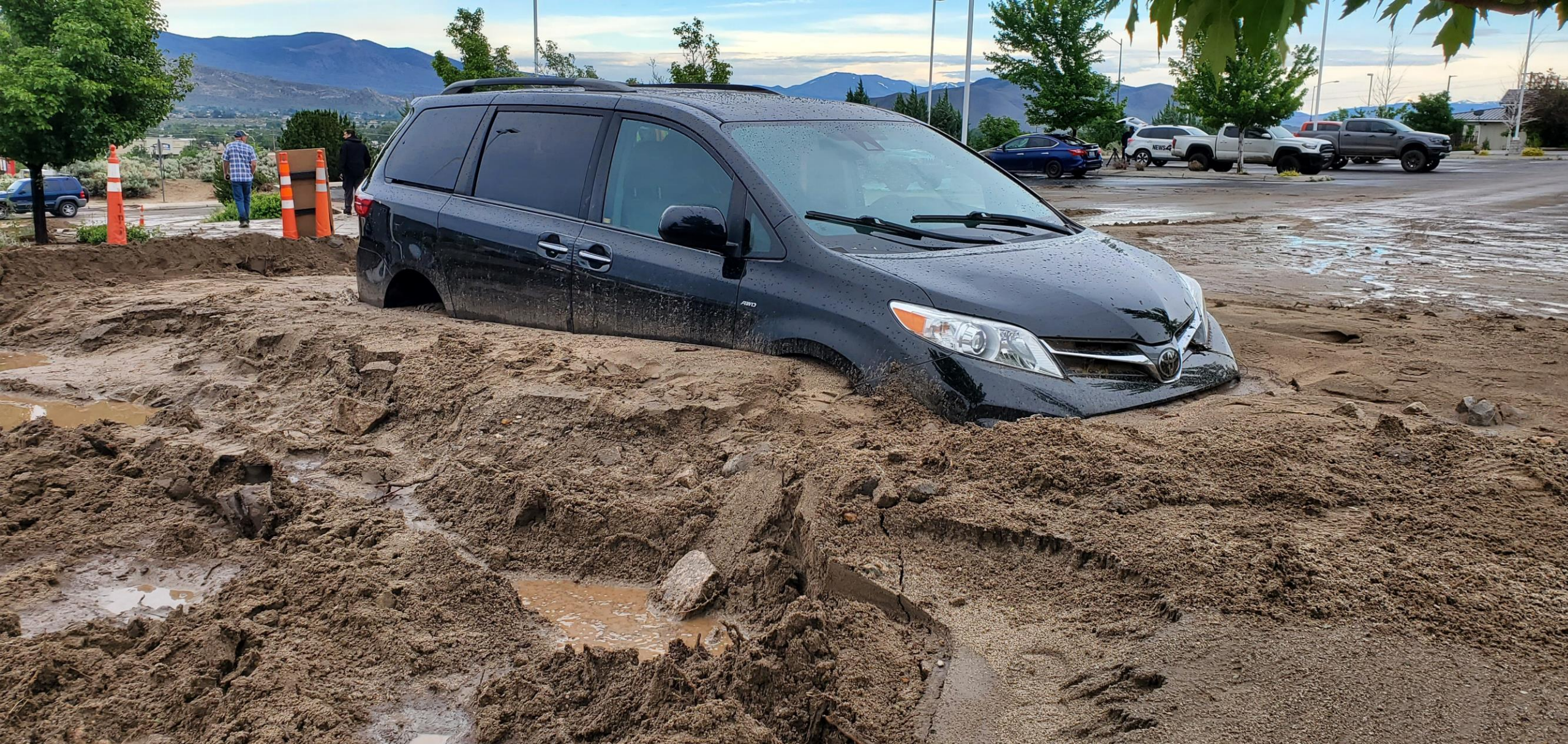
Casino Fandango, Carson City June 2023