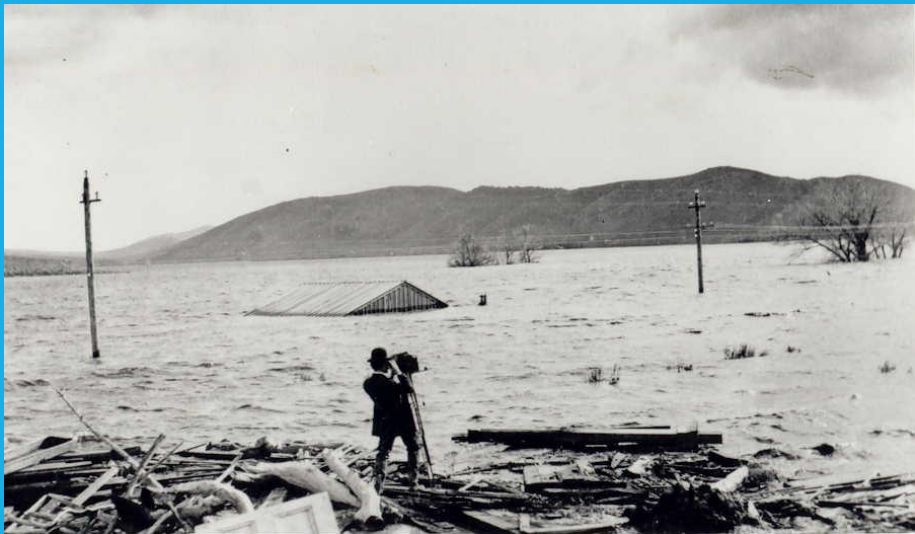
Empire (East Carson City, 1907, Photo Courtesy of Historical Society