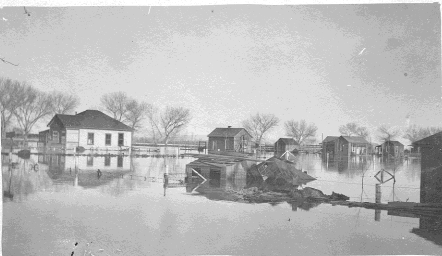
FALLO N FLOOD 1907