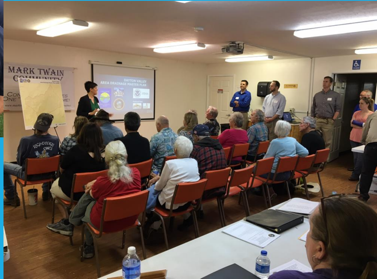
Virginia City, Sheriff's Night Out