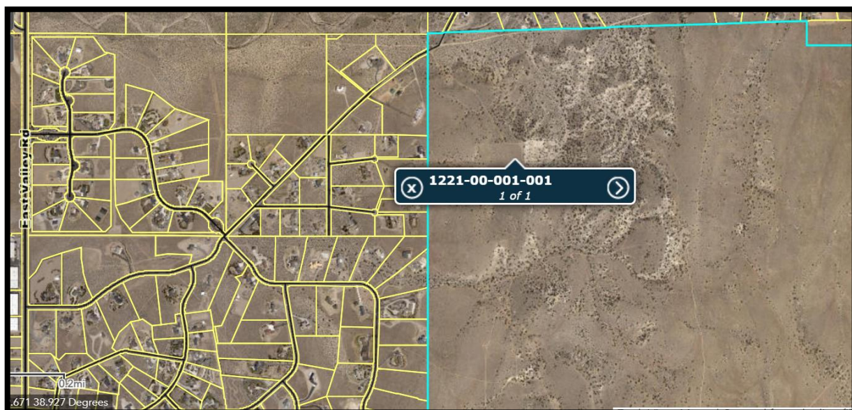
Figure 2: APN 1221-00-001-001 for proposed Sawmill Road Wash basin.