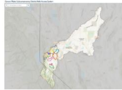
Carson River Watershed Flood Hazard Viewer