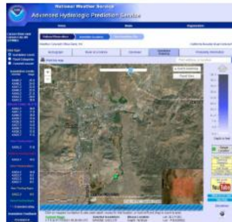
NOAA Advanced Hydrologic Prediction Service – Carson River Inundation